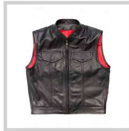
VEST - LEATHER