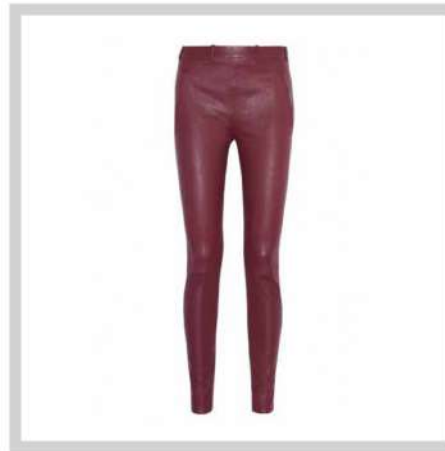
JEGGING - LEATHER