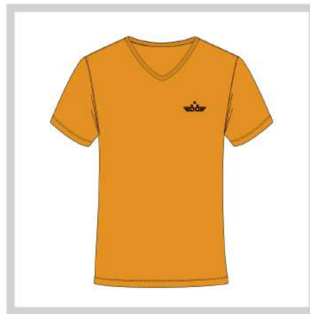
BASIC V-NECK TEE