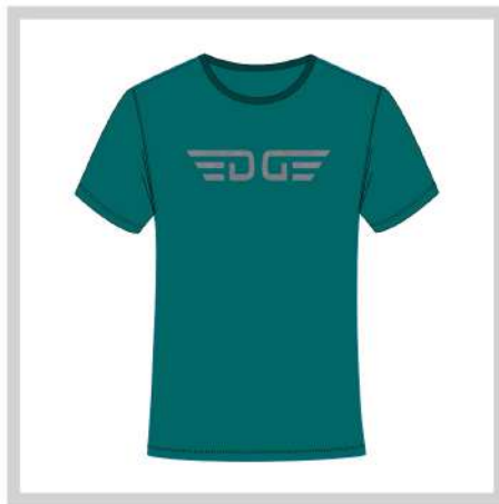
BASIC CREW NECK TEE