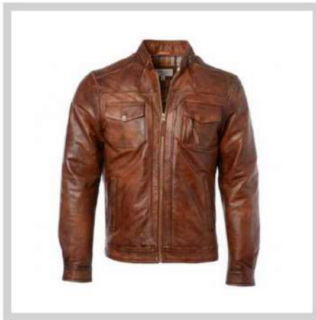
JACKET - LEATHER