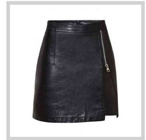
SKIRT - LEATHER

Lead Time: 60-70 Days | MOQ: 120pcs per size | Size Range: As Required